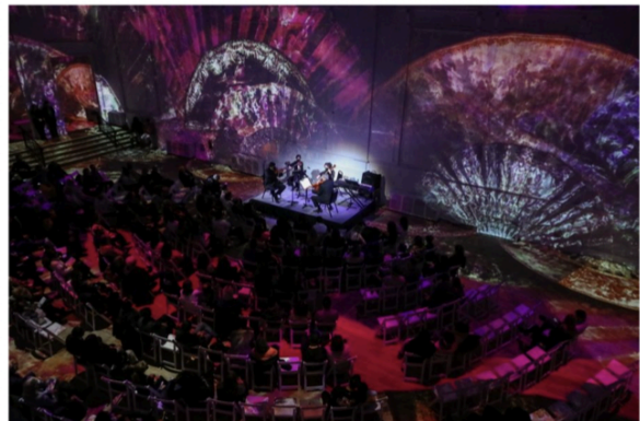
Jan. 27, 2023 Concert Event at Lighthouse ArtSpace Chicago